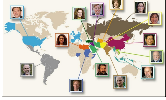
Visit ucs.nd.edu for more information and resources.

The stories touch on a number of key themes in our faith and society – including how Christians actually